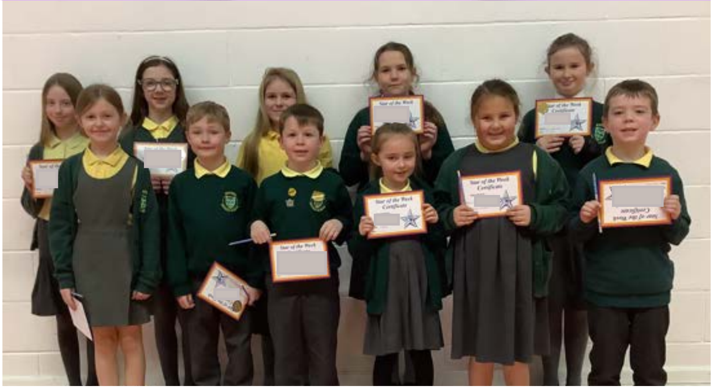
Malvern Kindness Award Winner