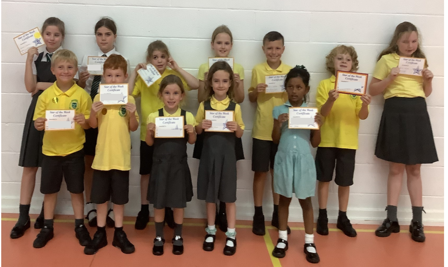
Malvern Kindness Award Winner