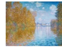
Impressionism - 1860s