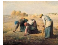
Realism - 1850s