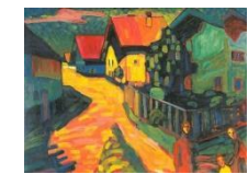
Expressionism - 1900s