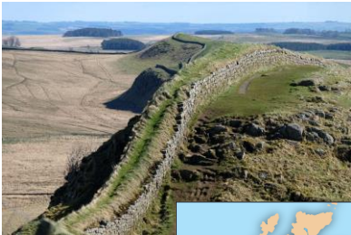
Hadrian's Wall was built to protect Roman territory against raiding and control entry into Britain. The Wall was also a place where communities developed.