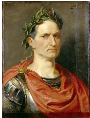
Julius Caesar was a general in the Roman army, who eventually became ruler of the Roman Empire. His rule lasted for less than one year before he was assassinated.