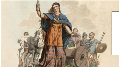
Boudica was an ancient Celtic queen who led a revolt against Roman rule in ancient Britain