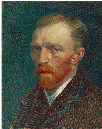
Vincent van Gogh and Starry, Starry Night