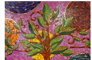
Laurel True artwork