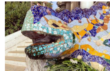
Antoni Gaudi artwork